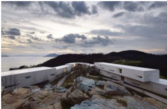
Namhae Linear Suite Gyeongsangnam-Do, Korea by BCHO Architects Seoul, Korea

Jury Comments: The clean, natural-finished wood base provides the perfect support for the residential forms above and provide a reversal of expectations for how this project could have been massed and detailed.