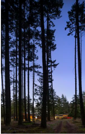
Henry Island Residence San Juan Islands, Washington by Bohlin Cywinski Jackson Seattle, Washington

Jury Comments: The design is made up of a clean kit-of-parts, used sensibly and sensitively. The design emphasizes a sense of the assembly of building elements that is very tactile.