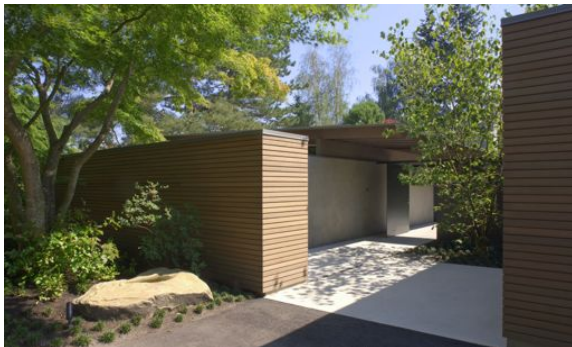
Urban Cabin Seattle, Washington by Suyama Peterson Deguchi Seattle, Washington

Jury Comments: This is an elegant, thoughtfully-designed building with a strong concept that is carried out at different scales.