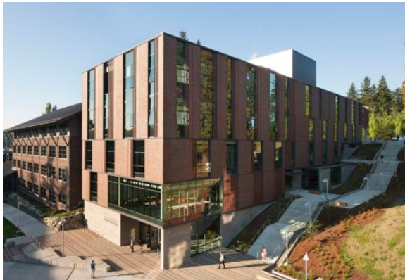
Discovery Hall, University of Washington Bothell, Washington by HACKER Portland, Oregon

Jury Comments: The curved, finely finished cast-in-place concrete, the craft-based decorative touches that humanize this esthetic, and the dramatic setting are all inspiring.