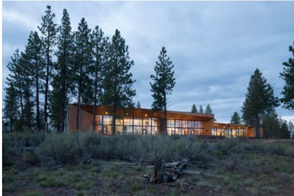
Unitarian Universalist Fellowship of Central Oregon Bend, Oregon by Hacker Portland, Oregon

Jury Comments: This is an elegant, thoughtfully-designed building with a strong concept that is carried out at different scales.