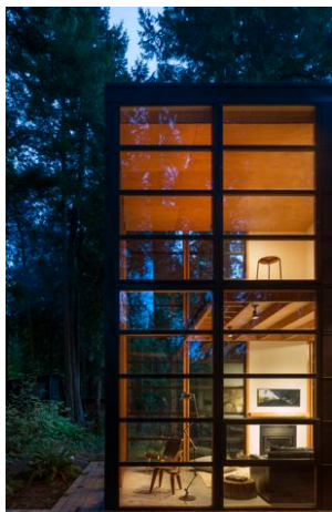
Lightbox Point Roberts, Washington by Bohlin, Cywinski Jackson Seattle, Washington

Jury Comments: Restrained and quiet, its fine finish and detail are consistent with its description as an "urban cabin."