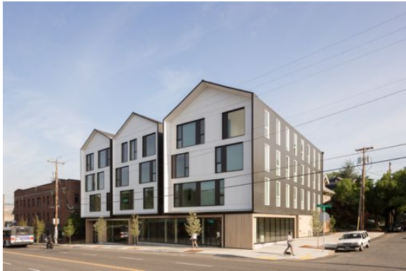
Langano Apartments Portland, Oregon by Works Partnership Portland, Oregon

Jury Comments: The clean, natural-finished wood base provides the perfect support for the residential forms above and provide a reversal of expectations for how this project could have been massed and detailed.