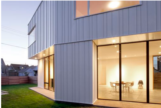
Pavilion House Portland, Oregon by Waechter Architecture Portland, Oregon

Jury Comments: The design is made up of a clean kit-of-parts, used sensibly and sensitively. The design emphasizes a sense of the assembly of building elements that is very tactile.